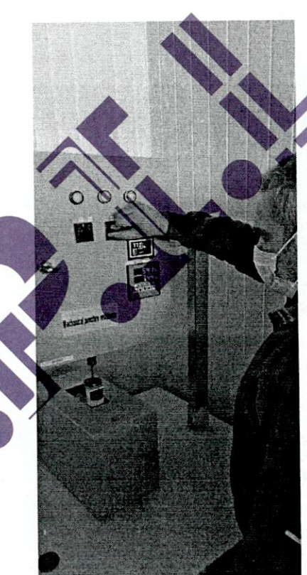
Figure 4: EUT under mechanical puncture resistance test