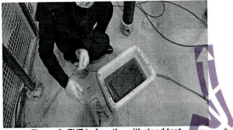
Figure 3: EUT before the withstand test